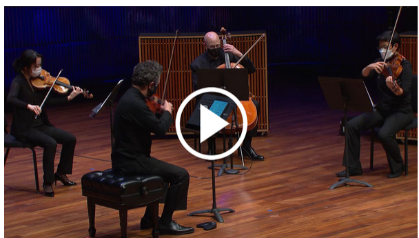
Billy Childs: String Quartet No. 3, Unrequited