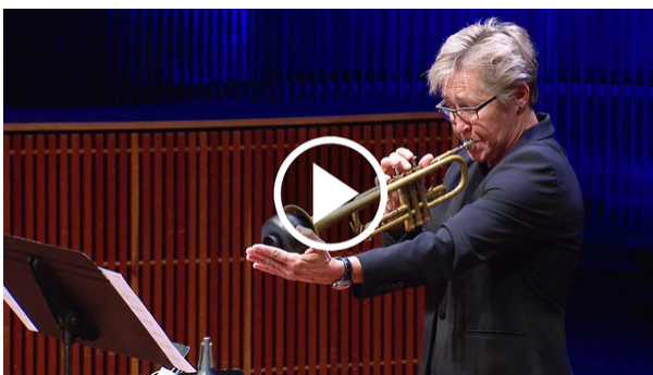
Tyson Davis: Tableau No. X for Solo Trumpet (world premiere, SPCO commission)