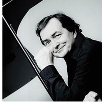
PIERRE-LAURENT AIMARD, piano 2006-2009 www.pierrelaurentaimard.com