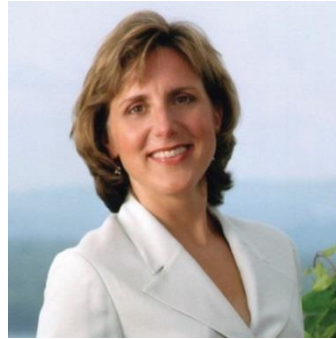
DAWN UPSHAW, soprano 2007-2013 www.colbertartists.com