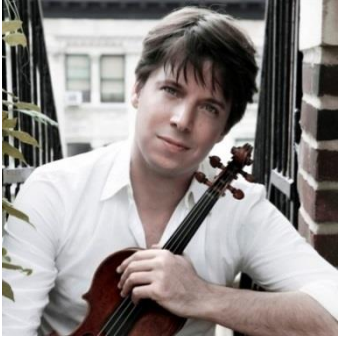
JOSHUA BELL, violin 2004-2007 www.joshuabell.com